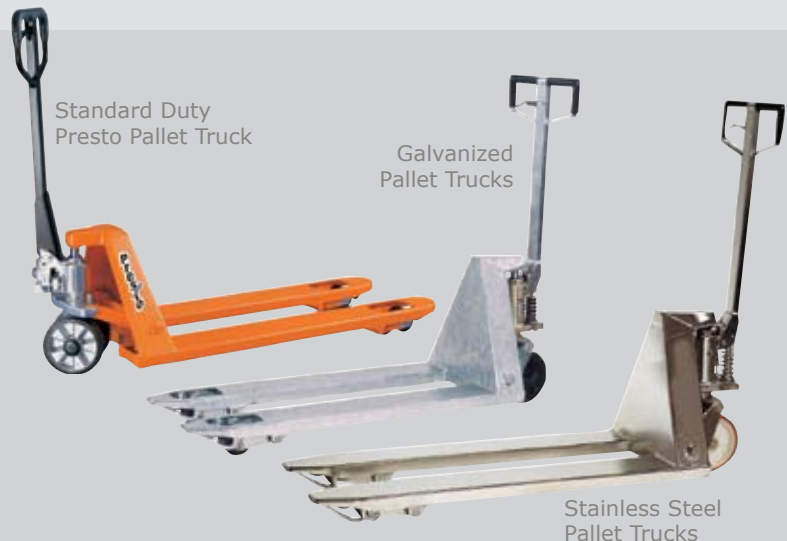
Standard Duty Presto Pallet Truck

For durable, economical hand pallet trucks, nobody beats Presto. Standard Duty trucks feature 5,500 lb capacity with a powder coated paint finish, reinforced forks, and an ergonomic handle. Stainless Steel and Corrosion-Resistant Zinc finishes are also available.