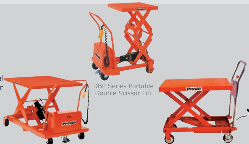
DBP Series Portable Double Scissor Lift

Presto Portable Lifts are available in both powered and manual lift configurations. Capacities range from 300 to 1,500 lbs with vertical travel up to 36". They are ideal for repositioning loads within a work cell or transporting them from one area to another.