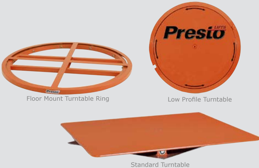
Floor Mount Turntable Ring