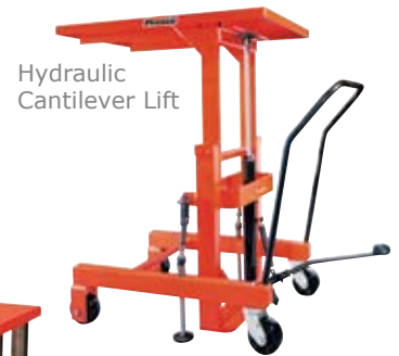
Hydraulic Cantilever Lift