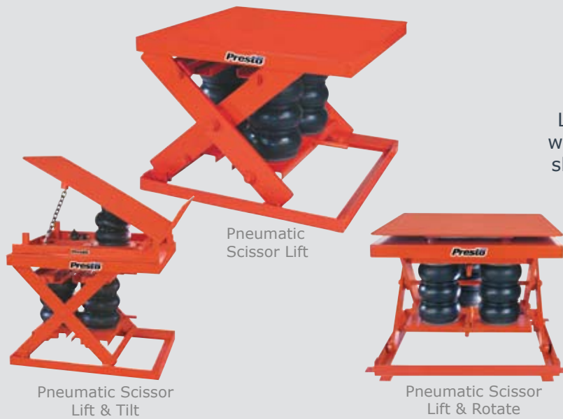
Pneumatic Scissor Lift