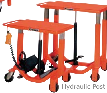
Hydraulic Post Lift