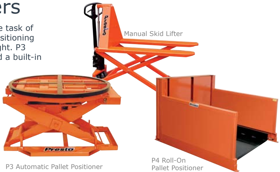
P3 Automatic Pallet Positioner

Presto Pallet Positioners simplify the task of loading and unloading pallets by positioning loads at a comfortable working height. P3 units feature automatic leveling and a built-in turntable for nearside loading. P4 units can be fed with a hand pallet truck and allow the operator to position the load at any height. Skid Lifters offer the added flexibility of transporting loads.