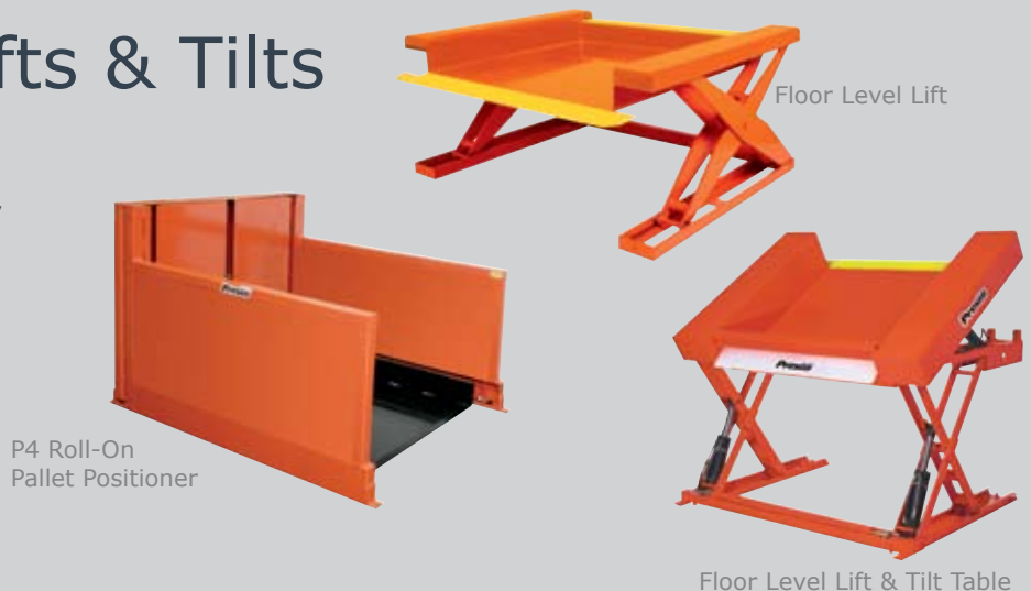
P4 Roll-On Pallet Positioner

Presto's wide variety of floor level equipment can be fed with ordinary hand pallet trucks, eliminating the need for fork lift trucks and trained operators. Lift only and Lift & Tilt models are available.