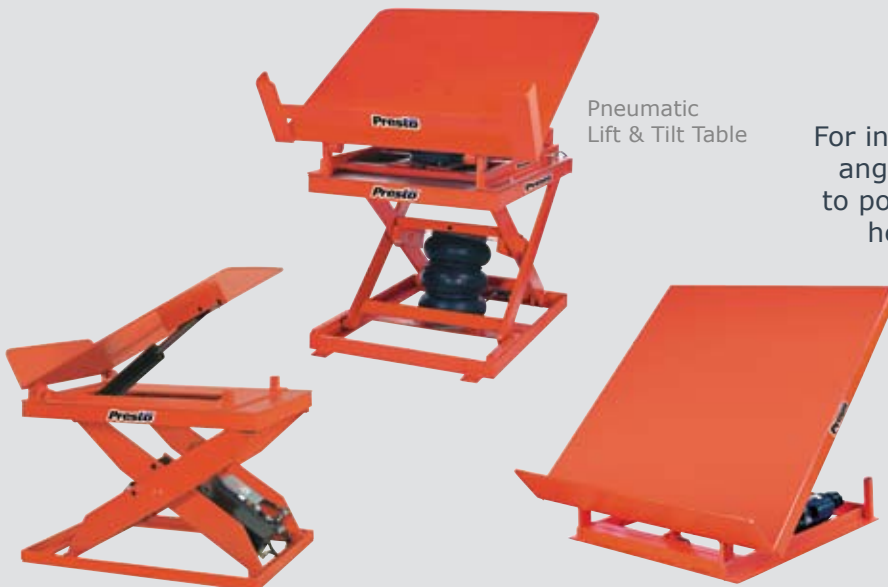
Pneumatic Lift & Tilt Table

For individual control of lift height and tilt angle, Presto Lift & Tilt tables allow you to position work at the most comfortable height and angle. Fixed Height Tilters are also available and can be mounted on legs, work benches, or directly to the floor.