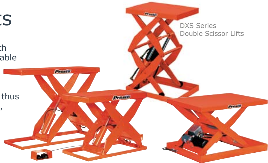
DXS Series Double Scissor Lifts

Presto Lifts offers a full line of Hydraulic Scissor Lift Tables with capacities up to 8,000 lbs available in: Light Duty, Standard Duty, Heavy Duty, and Double High configurations. They position material at just the right level, thus eliminating bending, stretching, lifting, and reaching.