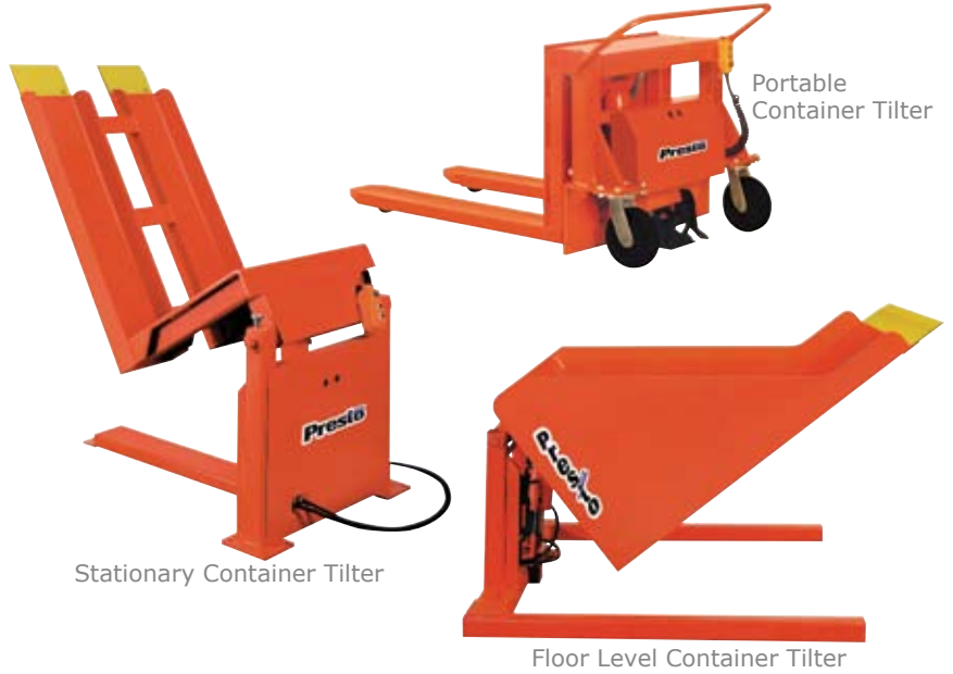
Stationary Container Tilter

Position containers and wire baskets at a comfortable height for accessing contents. Available in 2,000 and 4,000 lb capacities with 89° of tilt. Stationary units can be fed with hand pallet trucks. DC powered portable units are ideal for sharing between work cells or retrieving staged containers. Floor Level units work with any style of container and can also be fed by a hand pallet truck.