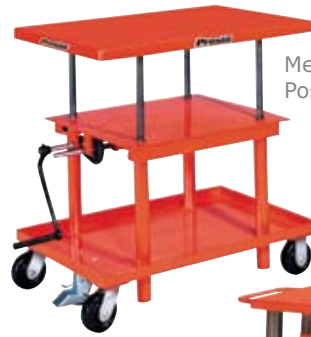
Mechanical Post Lift

Available in mechanical crank, four-post style, electric hydraulic and manual hydraulic post style, and manual hydraulic cantilever style. Choose from 1,000, 2,000, or 4,000 lb capacity units.